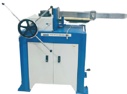
Torque wrench Tester