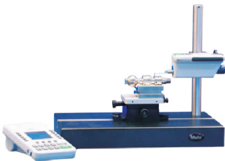
Surface Roughness Tester Mahr Germany