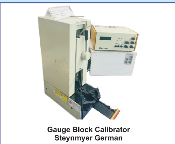
Gauge Block Calibrator Steynmyer German