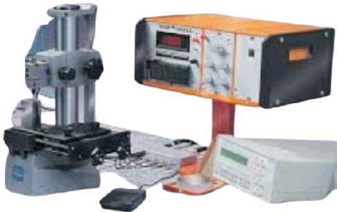
Gauge Block Calibrator Make Tesa Swiss