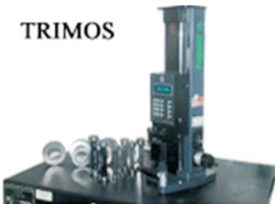
Electronic Height Gauge Trimos Swiss Make