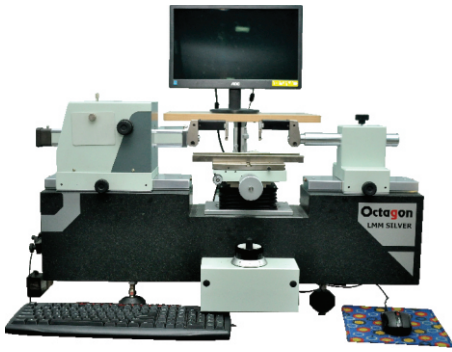
Length Measuring Machine