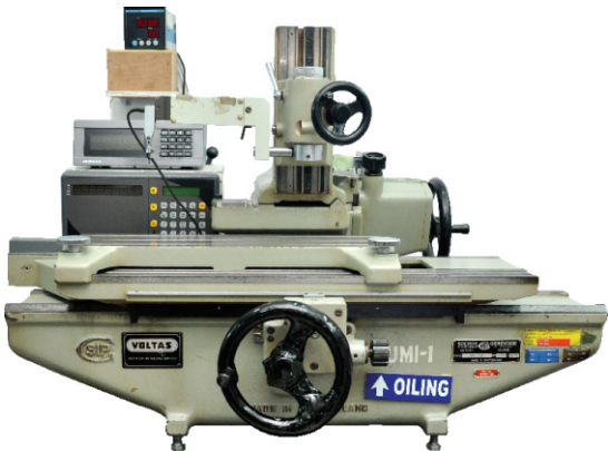
Length Measuring Machine Sip Swiss Make