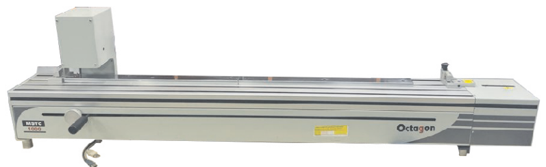
Length Measuring m/c Make - Octagon