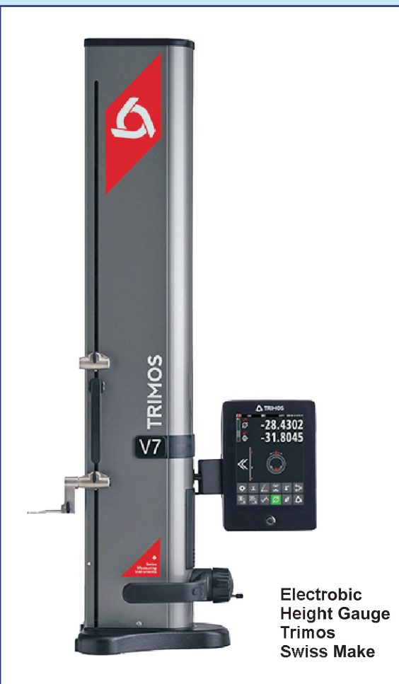
Electronic Height Gauge Trimos Swiss Make