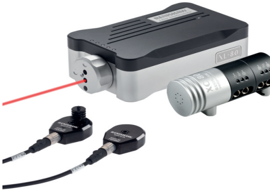
Laser Interferometer Make Renishaw - UK